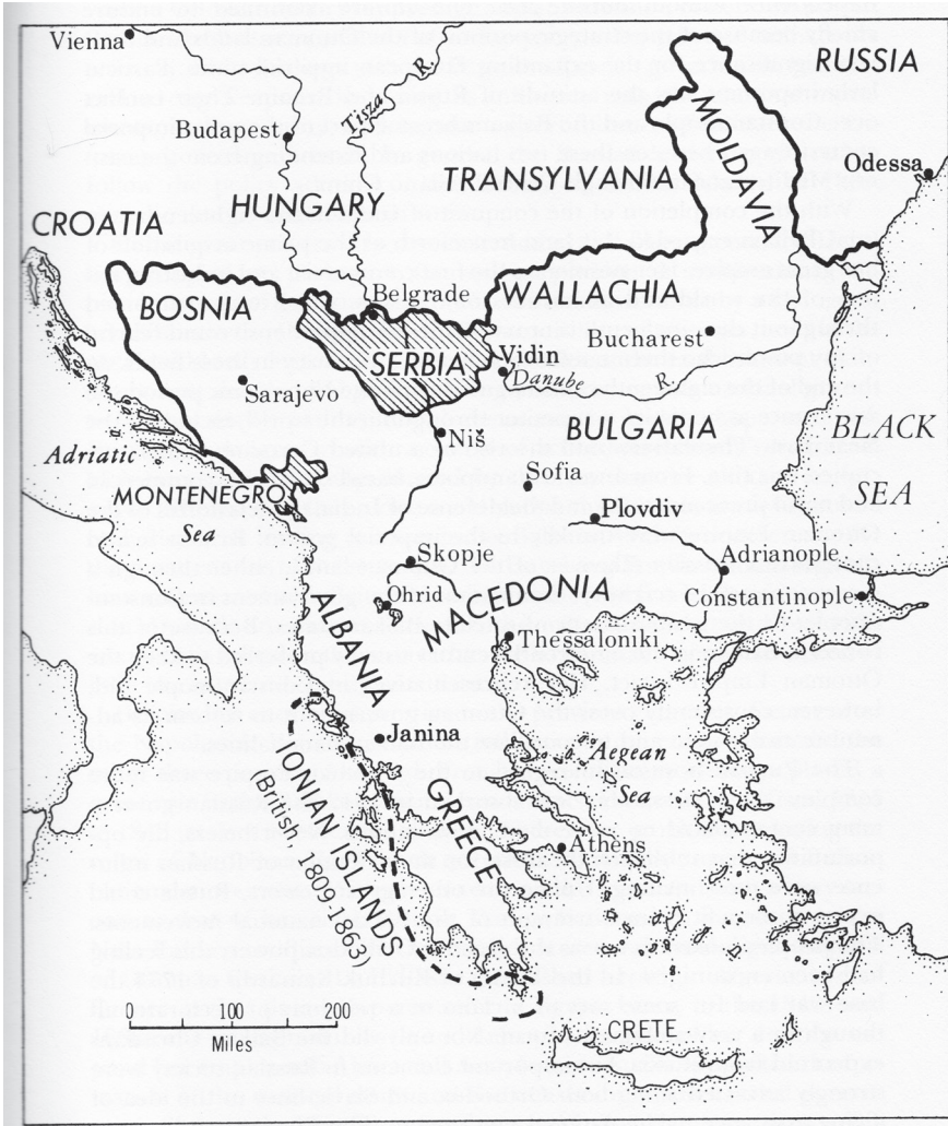
Map 3. The Balkans in 1815

war of liberation on behalf of the Balkan Christians; and Zastava was among the bitterest of these critics. There was considerable injustice in this: Michael was only too aware that Serbia's real military potential was far less than its strength on paper would suggest. None of this, however, was known outside of Serbian government circles, and the problem was compounded by the events of 1867, when the Prince, at the very time the Hungarian government was abandoning its Serb minority, showed every sign of having done a deal with Budapest. The Vojvodina became, more than ever, the center of agitation against the Serbian government. 70