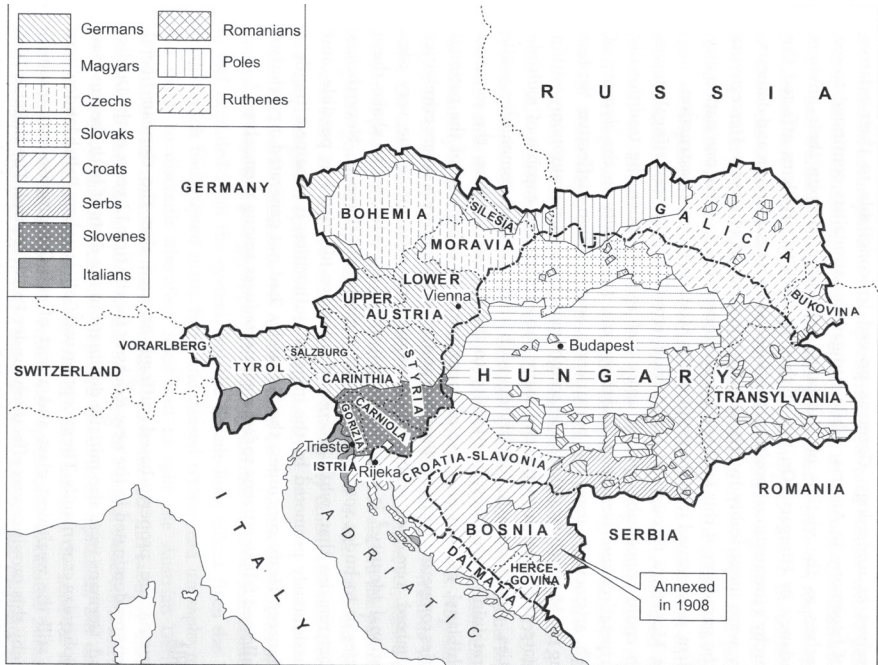
Map 2. Nationalities of the Habsburg Monarchy

The Austrian Statute 146 of 21 December 1867, by contrast, made no mention of the common foreign minister's obligation to consult with the ministries of the two halves of the Monarchy. Article 1(a) stated to be "common"