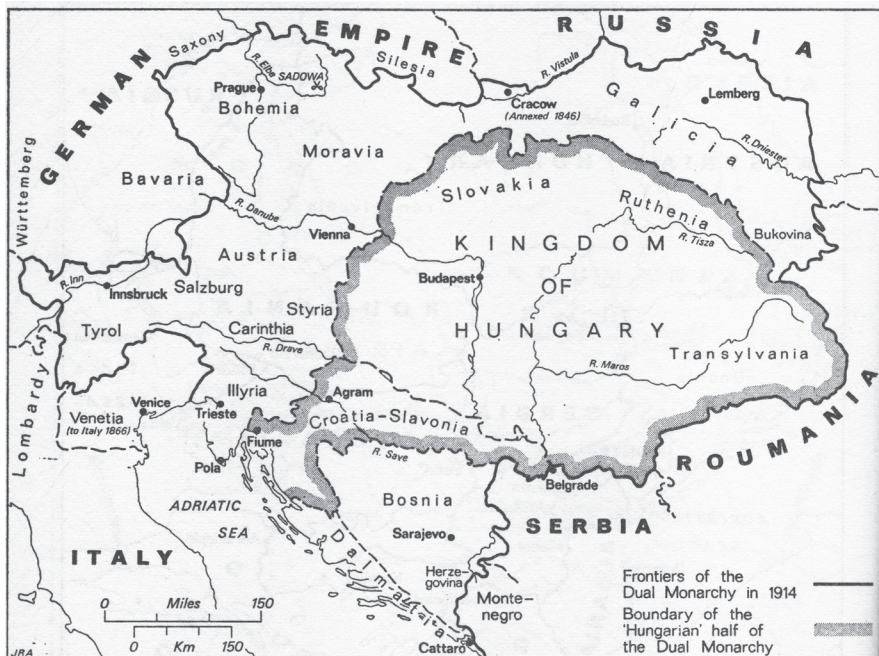
Map 1. The Dual Monarchy of Austria-Hungary after 1867

strictly speaking there was no text of the Settlement: “Dualism is regulated by two laws, analogous or identical in content.” 1 The Hungarian Law XII of 1867, as the senior of these two laws by some six months, deserves to be regarded as the original version, the model of the subsequent Austrian law, and, on the subject of foreign affairs, the more unambiguous. Paragraph 8 stated that