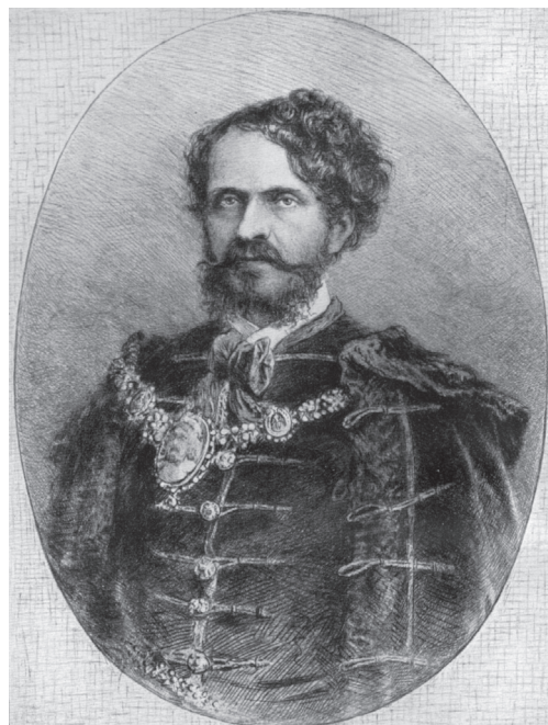
Figure 3. Count Gyula Andrassy

By 1867, Andrassy was, more than ever, obsessed with the danger to Hungary from Pan-