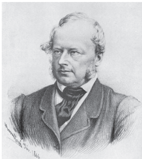
Figure 2. Count Friedrich Ferdinand von Beust

It was essential, therefore, to forestall an explosion by improving the lot of the Balkan Christian