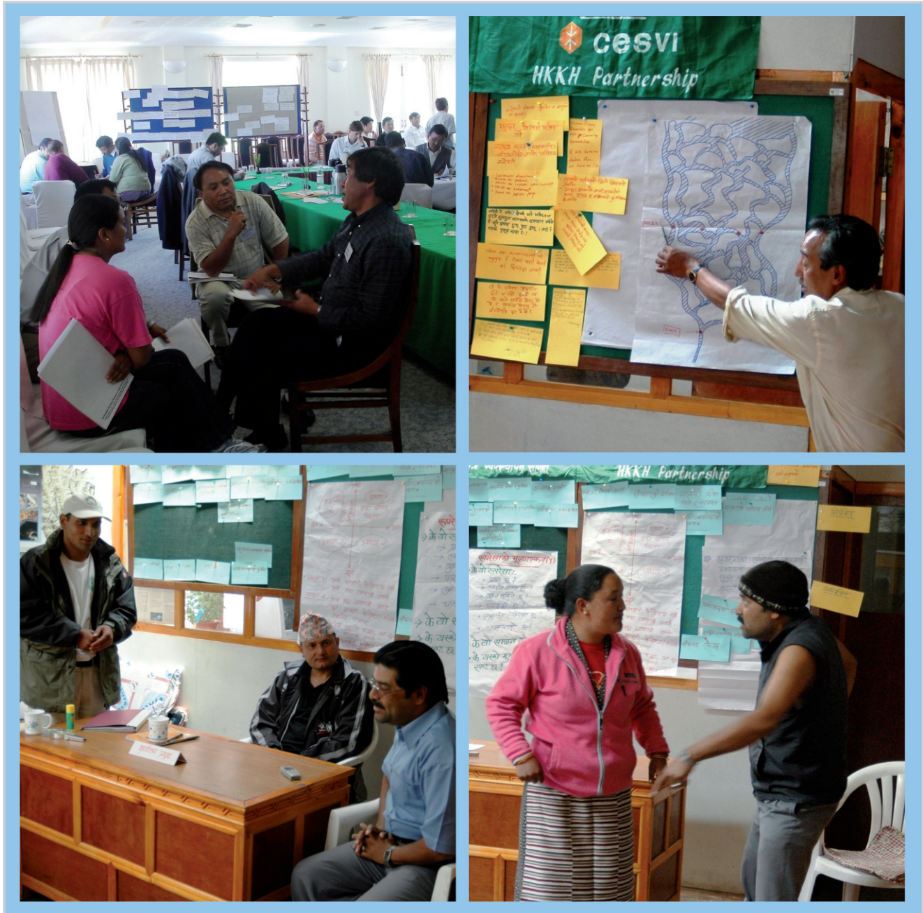
FIGURE 3 Clockwise from top left: (1) Scenario group work with tourism industry and NGO experts during the first workshop; (2) we presented the growing uncertainty of future park states and trajectories as sequential points along a braided river channel; (3) during our second scenario workshop, an actor plays a rogue community member as a metaphor for loss of local social norms; (4) in another dramatized scenario, an outside businessman tries to influence local park officials.

strongly supported park management devolution and local self-governance. However, discussion of the “autonomous Khumbu” scenario surprisingly revealed that participants did not have full confidence in local