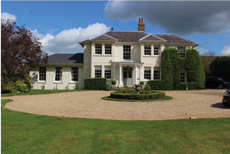
Fig. 2 Park Gate House.