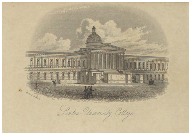
Fig. 3 UCL in c. 1828.

characteristic was to be its teaching of practical sciences and technology in response to the demands of the time. It was an institution well suited to an age of ‘progress’ and ‘sciences and technology’, symbols of nineteenth-century European civilisation after the industrial revolution. When King’s College, affiliated with the Church of England, was established, the name of the university was changed to University College, and in 1836 both institutions came together to form the University of London. They would play a significant role in modern higher education in the United Kingdom.