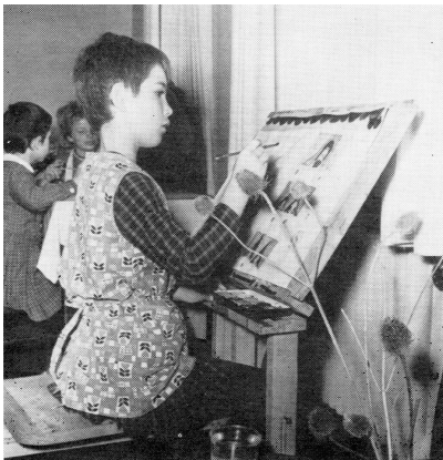
Figure 0.3. The author's mother in an arts class at Buna's Haus der Freundschaft, 1968.