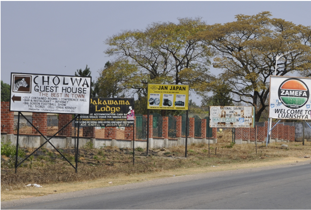
Figure 0.1. The signposts and metal arch welcoming the visitor to Luanshya.