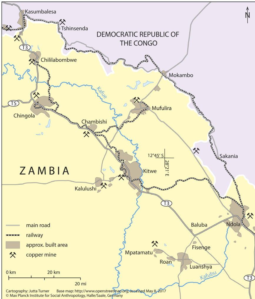
Map 0.2. Zambia's Copperbelt with its most important towns and mines on both sides of its border with the Democratic Republic of the Congo (DRC).