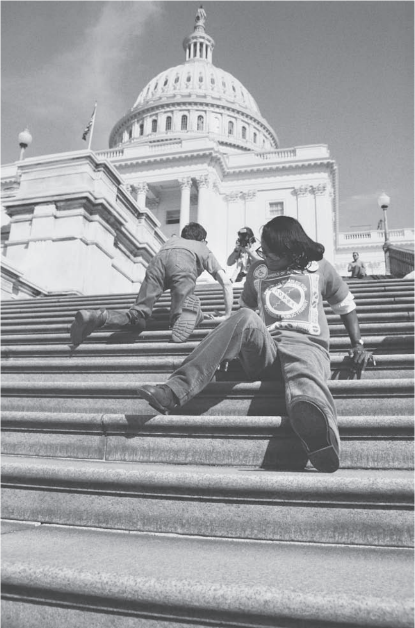
Fig. 2. Tom Olin, “Day in Court for Americans with Disabilities Protests Planned over Supreme Court’s ADA Rulings.” March 1990. Reprinted with permission.