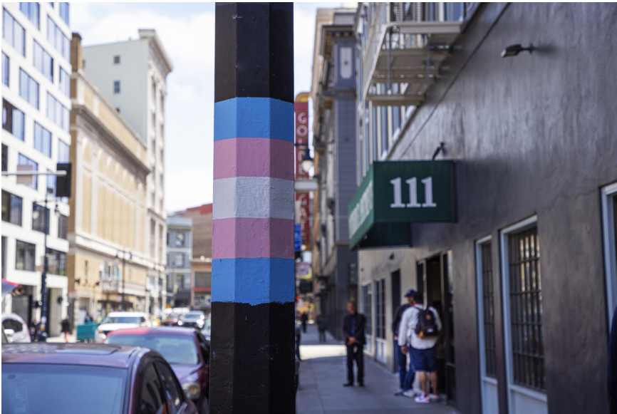
FIGURE 3. Trans flags painted on light poles in San Francisco's Compton's Cafeteria Transgender Cultural District in June 2023.